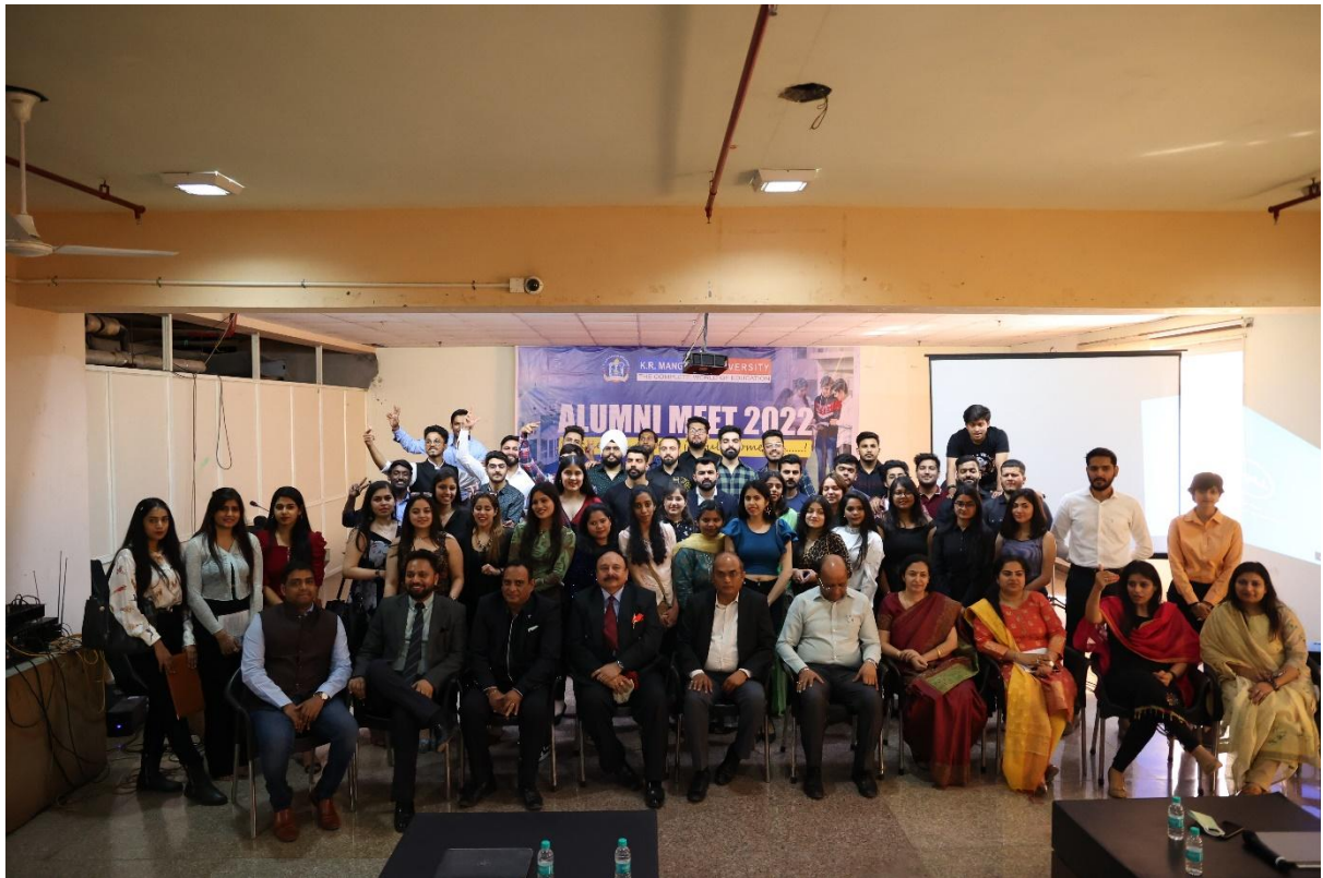
Photos 5 Alumni group-photograph