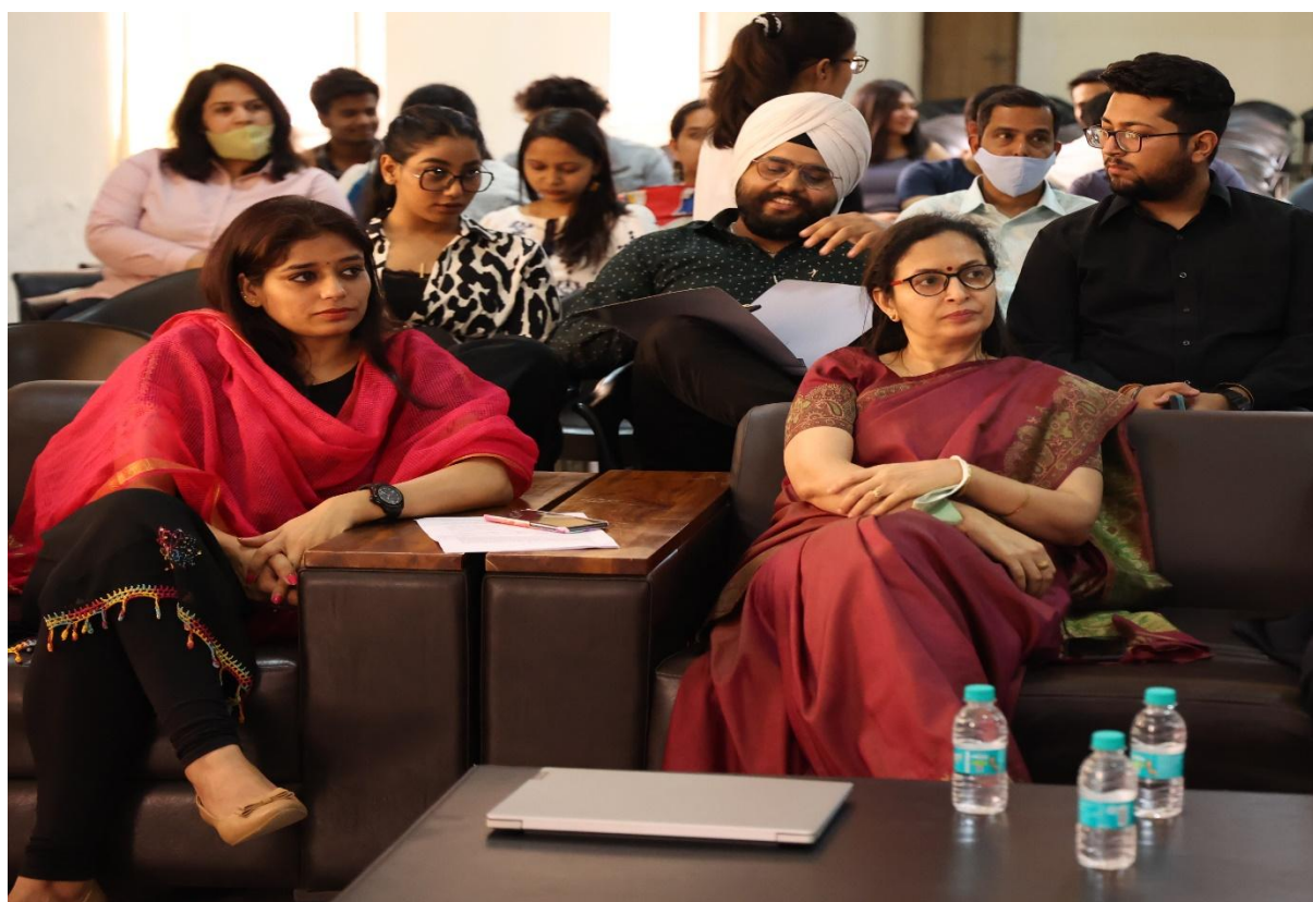
Photo 4 Esteemed guests and Alumni