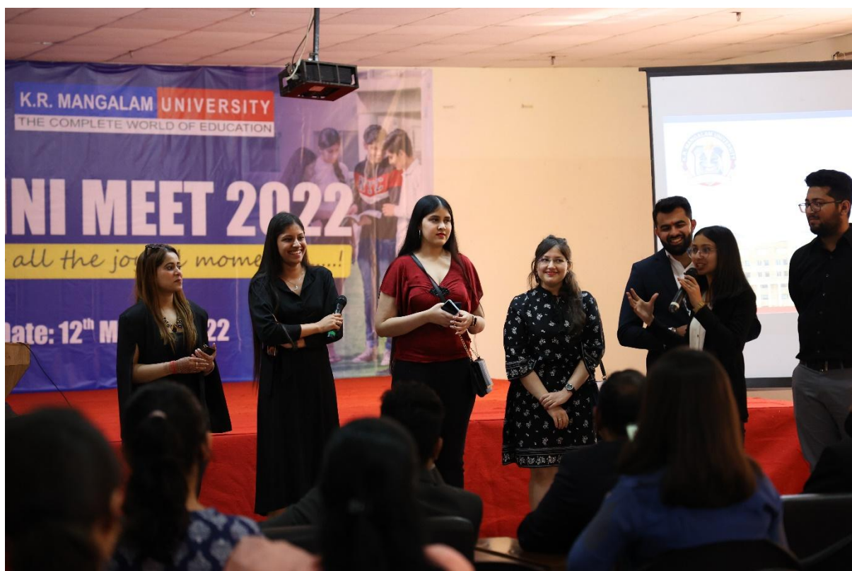
Photo 3 Alumni indulged in introduction and games