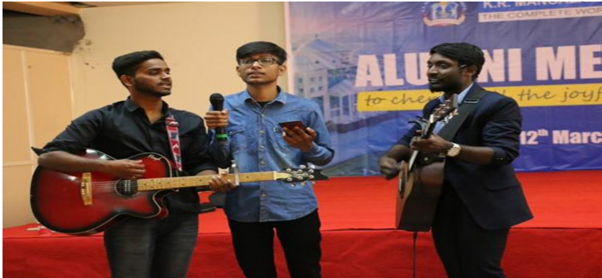
Photo 1 Students serenading the alumni with a heartfelt welcome melody